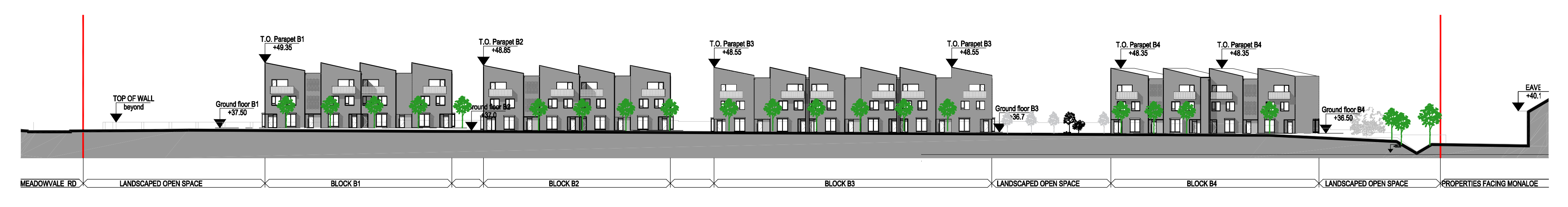
SECTION 02 SCALE 1:500 ENTRANCE ROAD - CONTIGUOUS ELEVATION OF DUPLEX BLOCKS B1 TO B4

SCALE 1:500 ENTRANCE ROAD - CONTIGUOUS ELEVATION LOOKING AT CRECHE AND APARTMENTS